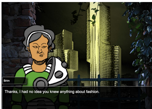
Figure 3: Screenshots showing the player initiating a Backhanded Compliment, and the NPC choosing a Backhanded Response.

fair deal of abstract reasoning and imagination. Future work will involve investigating authorship and creating guidelines for exploring the space of a social practice.