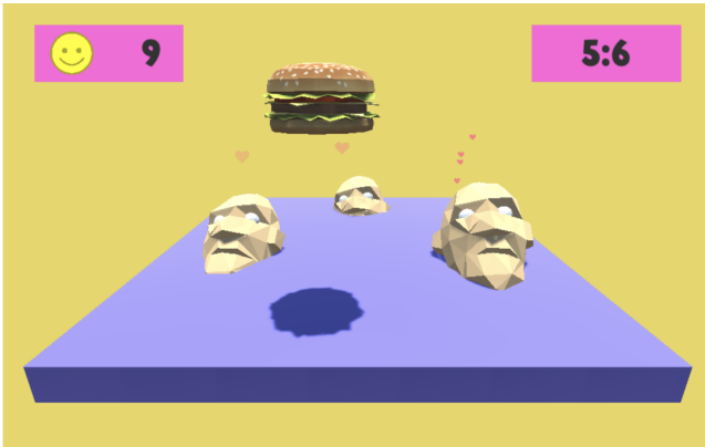
Figure 4: This rethemed version of whack-a-mole, The Burger Feed , was especially created for this paper as a thought experiment. Rather than dispatching moles with a mallet, players satisfy the hunger of customers by lowering a burger onto their face. The formal mechanics are the same as whack-a-mole, but the game has become an order-fulfillment game, whereas it wasn't previously (we claim). (For the record, this game is real, not just a mockup, and we have had people play it to see what they think.)

fast as possible. And this is indeed pretty clearly an order-fulfillment game.