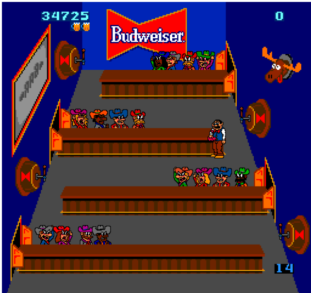
Figure 1: In Tapper , the player serves beer to an onslaught of thirsty customers, and collects the empty mugs after the bar patrons have finished consuming the beverage.

them a bit? A first proposal: Order-fulfillment games are games about a player serving items repeatedly to keep countdown timers from reaching zero.