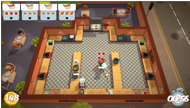
Figure 5: In Overcooked , players fulfill orders in a restaurant by preparing, cooking, and serving food. The customers' orders are represented by the "tickets" on the top left of the screen.