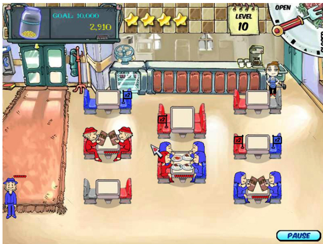
Figure 3: In Diner Dash , the player provides table service to a diner’s patrons, juggling the various duties of a restaurant service worker.

features like the “time left” to serve a particular customer, or that we’re “running out of time” to do so.